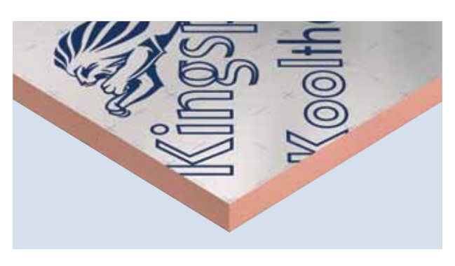
Figure 3 Super high performance Kingspan Kooltherm<sup>®</sup> K8 Cavity Board